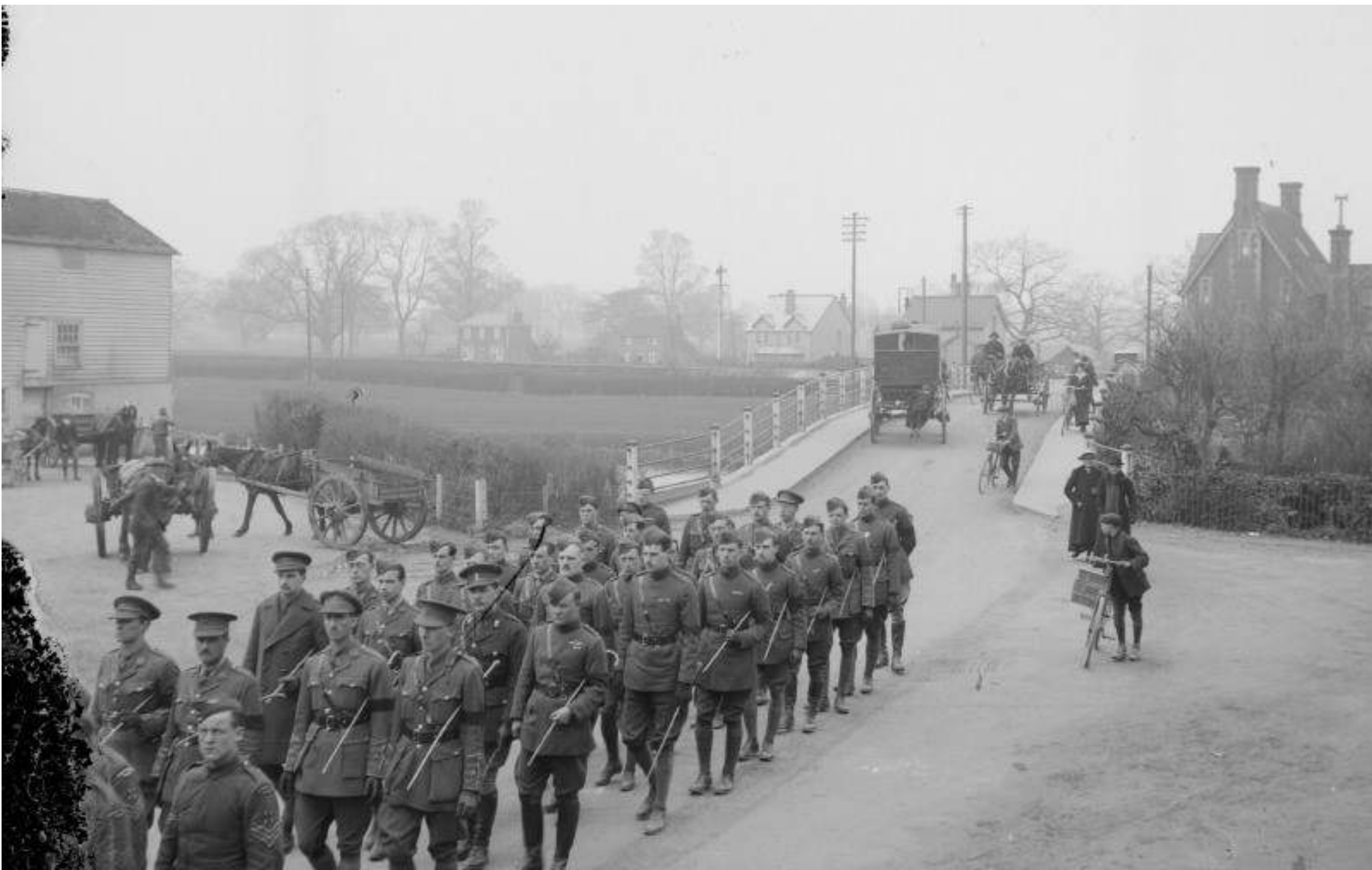
Soldiers entering Wye just past what is now The Tickled Trout pub.